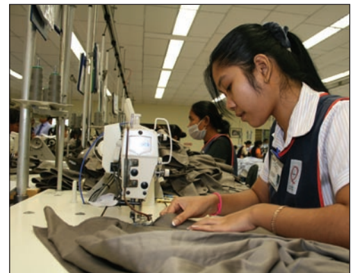
The garment industry in Cambodia has seen job losses as a result of the global financial crisis.

Working with national researchers, ODI has conducted an assessment of the impact of the financial crisis in 10 countries – Bangladesh, Benin, Bolivia, Cambodia, Ghana, Kenya, Nigeria, Indonesia, Uganda and Zambia. An ODI Working Paper discusses the macro-economic, poverty and social protection impacts (te Velde et al, 2009). This paper highlights social protection, underscoring its importance to stop people falling into poverty; stop the poor and vulnerable falling deeper into poverty; and promote the livelihoods of poor people so they can catch the upturn when it comes. It examines social protection policy responses to date.